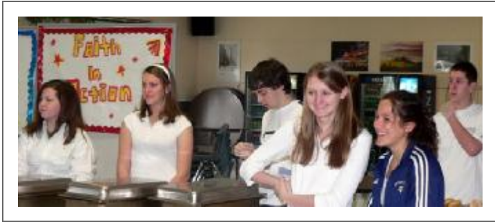
Students from Notre Dame Serving Volunteers